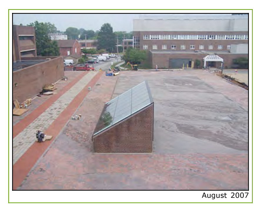
McKinly Lab Renovation Completed