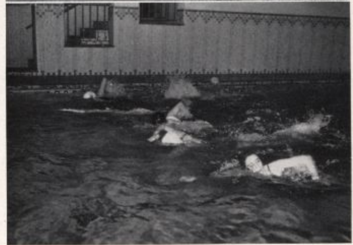
A dive and a dip in the pool.