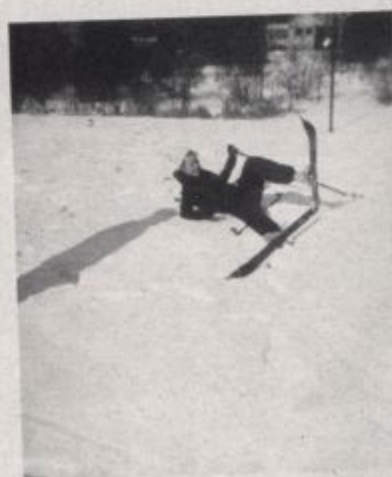
"V" for Victory