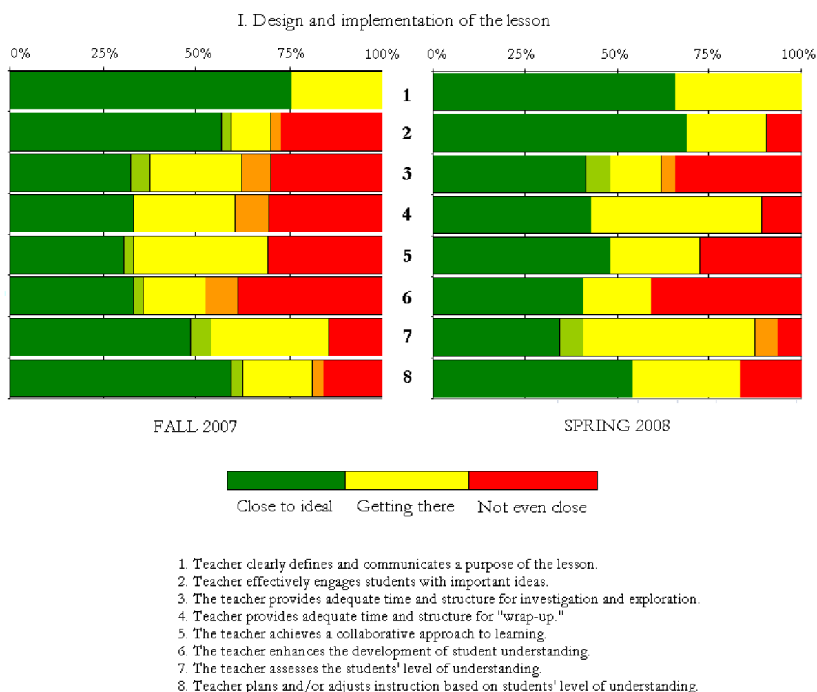
FIGURE 1. Design and implementation of the lesson FALL and SPRING

spring, there was a decrease from 30% to 14% for teachers rated “not even close” by spring (Question 4). However, similar to last year (Uribe-Zarain, 2007) 2 , there is still room for improvement in this area, especially since “summing it up” represents an opportunity for the teacher to orchestrate the presentation of student ideas that have resulted from the exploration phase and, in so doing, draw out the important mathematical ideas from the lesson. This is where mathematical connections are often made and may be a final opportunity for the teacher to assess the impact of the day’s lesson.