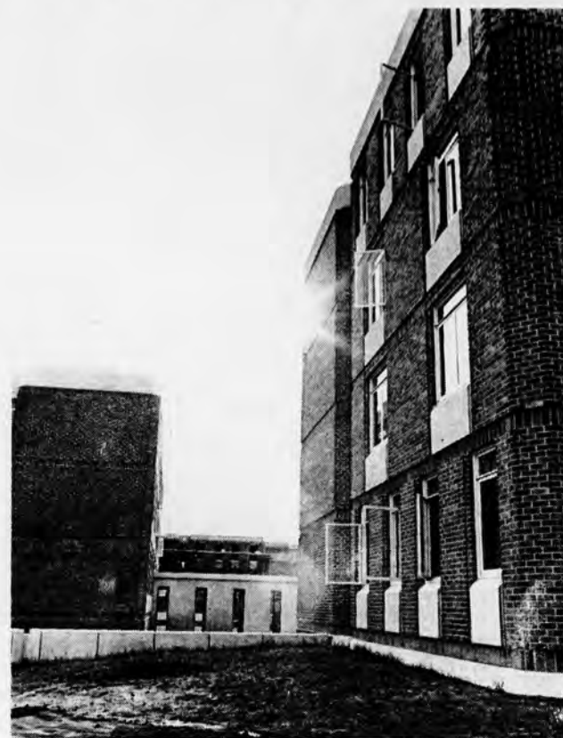
ANOTHER COMPLEX SPROUTS FROM THE EARTH over there beyond West (oops!...Rodney). Students who recall moving into Rodney (then West) in September '66 will recall (with nostalgia) the workmen, the dust, the mud, the new things, and the unfinished things.

Also, the periwinkle which appears to be thriving in the area is being removed and replaced by more walkways and sod for beautification.