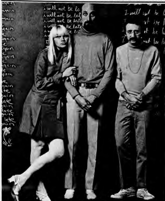
PETER, PAUL AND MARY, tops in folk music, appear Saturday, in Philadelphia, following release of their new album, "Late Again." Tickets for the show and transportation are available at the Student Center desk between 11 a.m. and 1 p.m. Concert trip is sponsored by Lutheran Student Association.