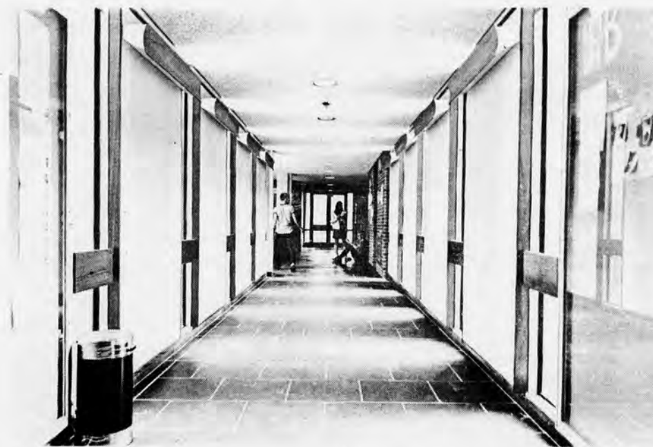
soundproof lounge shared by the brother and sister dorms.

Besides the floor lounges, there is a common