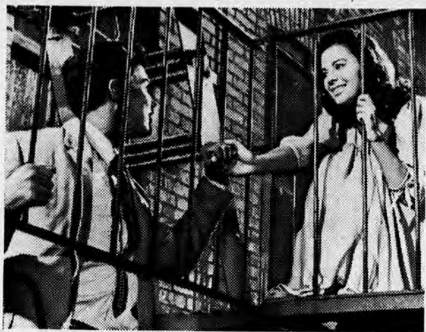
RICHARD BEYMER tells Natalie Wood that he's in love with her in "West Side Story," which is being re-released by United Artists, Transamerica Corporation. The picture in Panavision and Technicolor, will open tomorrow at the Cinema Center.