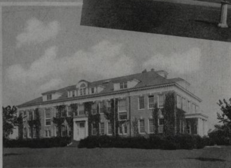
WOMEN'S COLLEGE OF DELAWARE