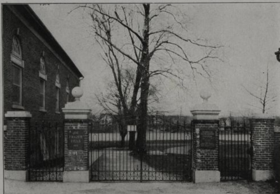
FRAZER FIELD ENTRANCE