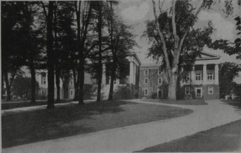
OLD COLLEGE (From Recitation Hall)