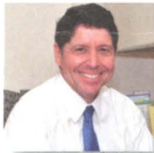
State Representative Paul Baumbach 23rd District Newark

The ATV will allow firefighters and EMTs to quickly and effectively respond to emergencies, whether it's an injured person or a brush fire (the ATV is equipped with a 55-gallon water tank to fight small fires in addition to a stretcher).