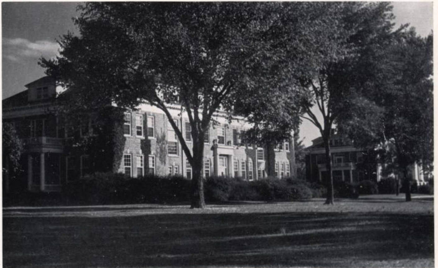
From the west side of the campus looking north down the elm lined classroom and dormitory buildings, Science and Residence Halls.