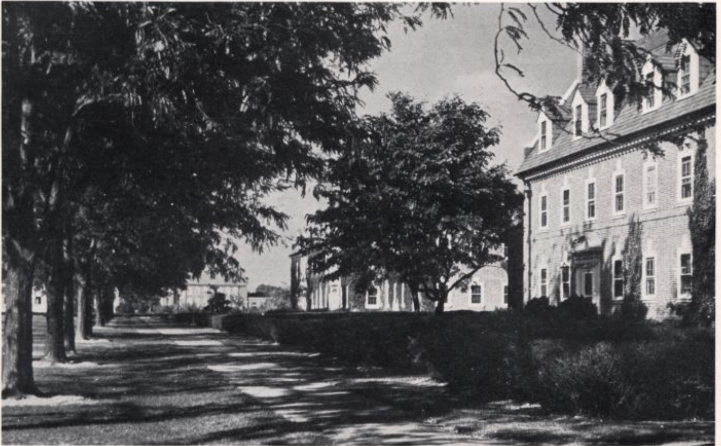
From the south of the campus looking north passed the twin buildings of New Castle and Sussex that face the center of campus.