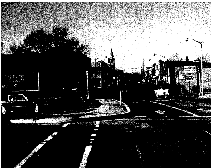
The eastern entrance to downtown Seaford could be given a welcoming appearance.

Finally, the parking lot on the northwestern corner of High Street and Market Street is very unattractive. It is poorly surfaced with a material that spreads across the sidewalk. This lot should be improved, landscaped, and linked to a general effort to improve the availability of parking in the downtown.