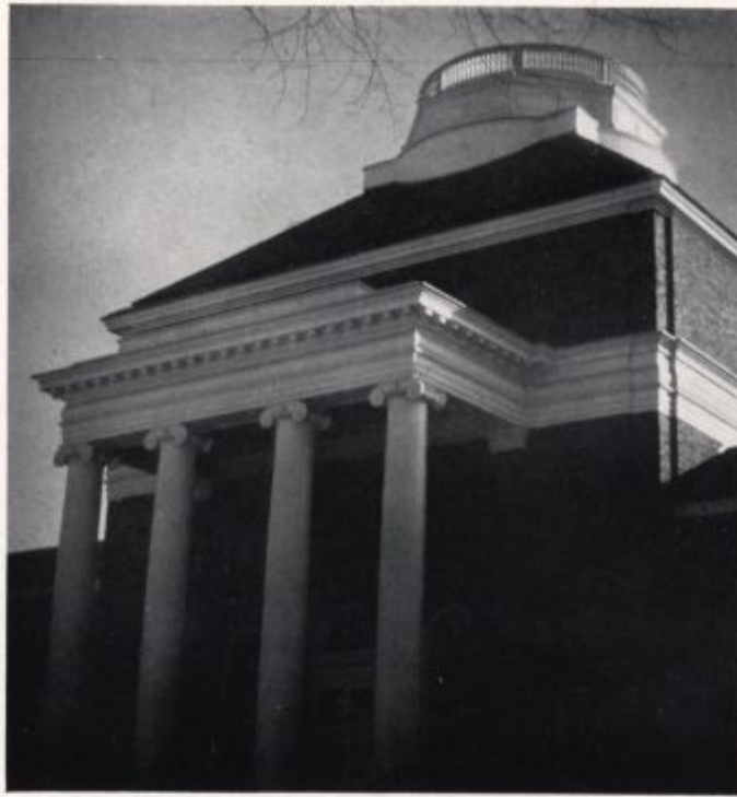
The college heights—an upward view of the middle section and door of the library.