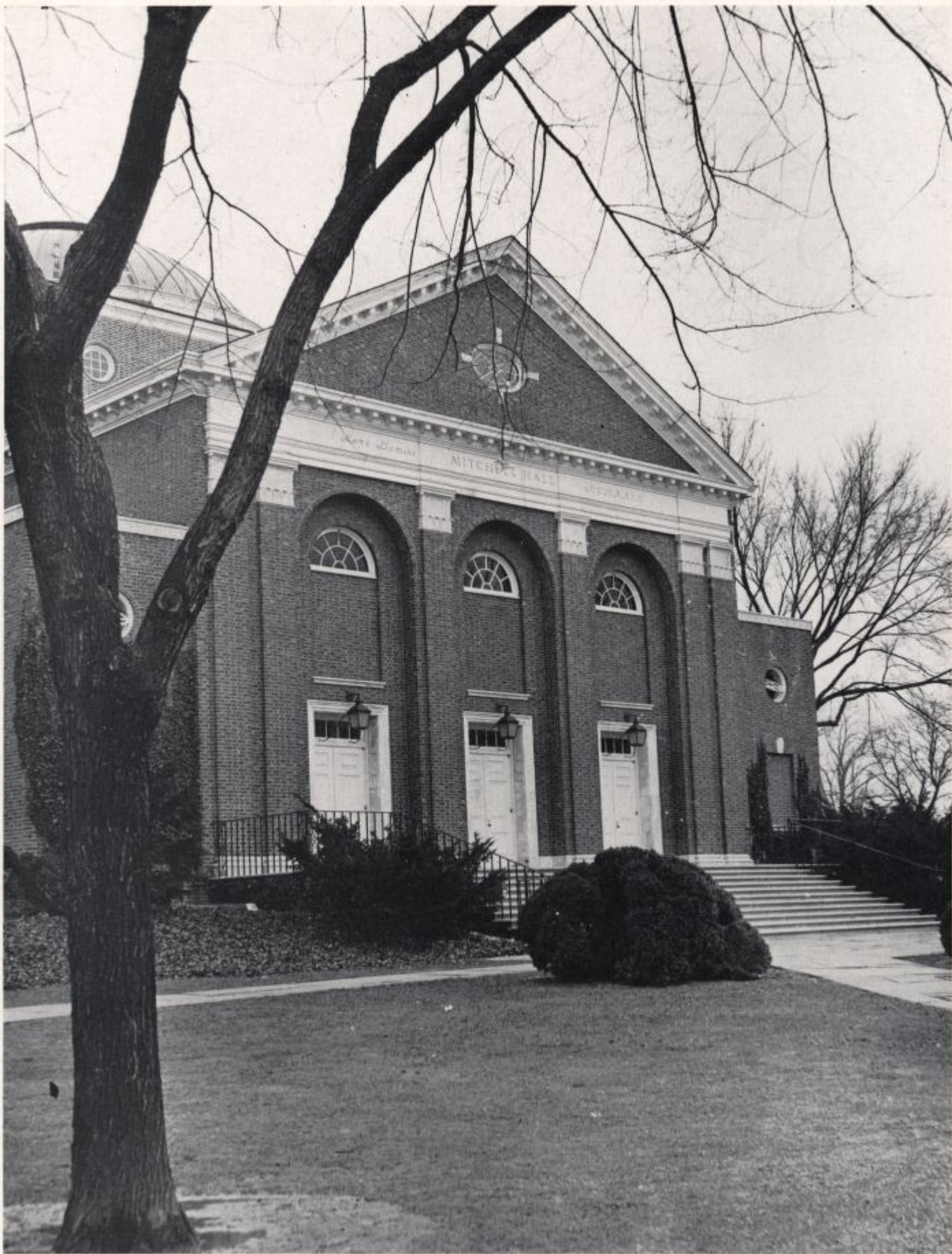
HEIGHTENED BY A SPREADING DOME, MITCHELL HALL ADMITS AUDIENCES THROUGH A THREE DOORWAY FRONT, SIMPLY LINED AND APPROACHED FROM WHITE STEPS.