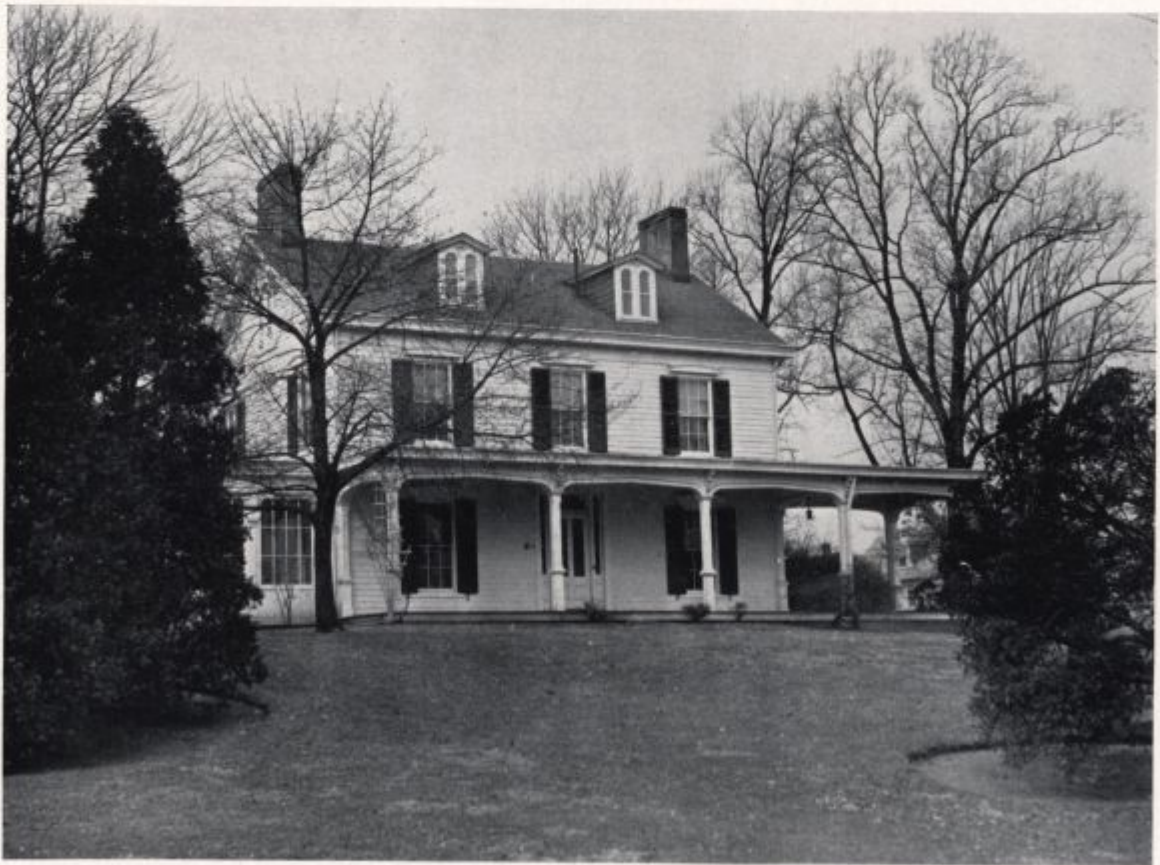
THE KNOLL, WHERE THE PRESIDENT OF THE UNIVERSITY LIVES AND ENTERTAINS A winter scene but without the snow that is often seen hovering over the evergreen trees or blanketing the sloping lawn