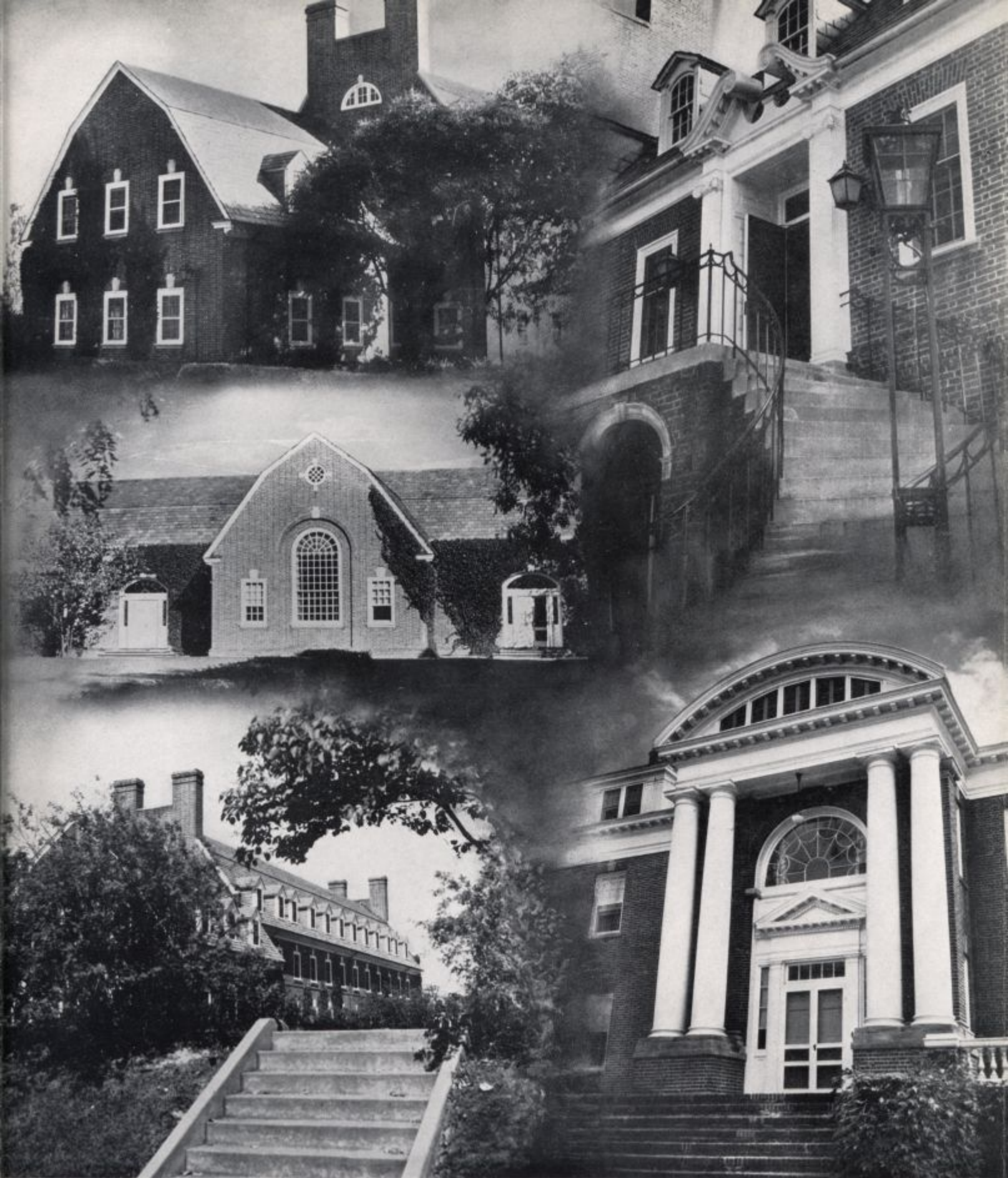
The quaint north wing of Sussex Hall, which is complementary to the almost adjacent south wing of New Castle Hall.