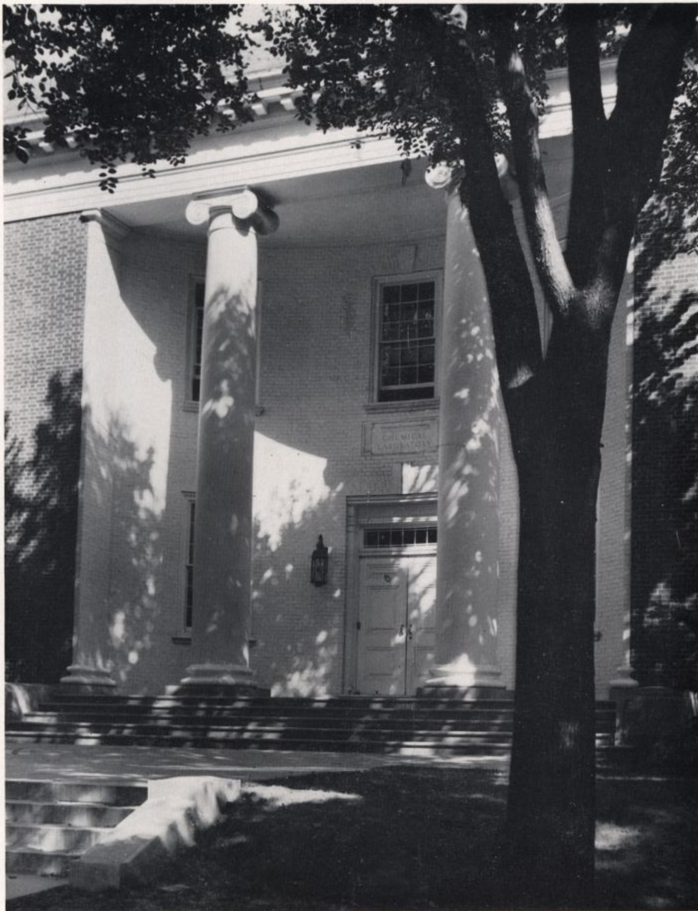
THE CONCAVE AND COLUMNED PORTAL OF THE CHEMISTRY BUILDING, WHITENED TO CONTRAST WITH THE BRICK REDNESS OF THE WALLS.