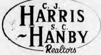
EXHIBIT HOME OPEN: Sat. 1-4:30; Sun. 1-7 Daily by appointment.

DIRECTIONS: Drive out West Main St., to Bent Lane, turn left and continue straight to MAPLEWOOD Signs.