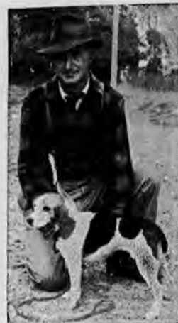
Rumer Photo R. R. Connell's "Dixie"