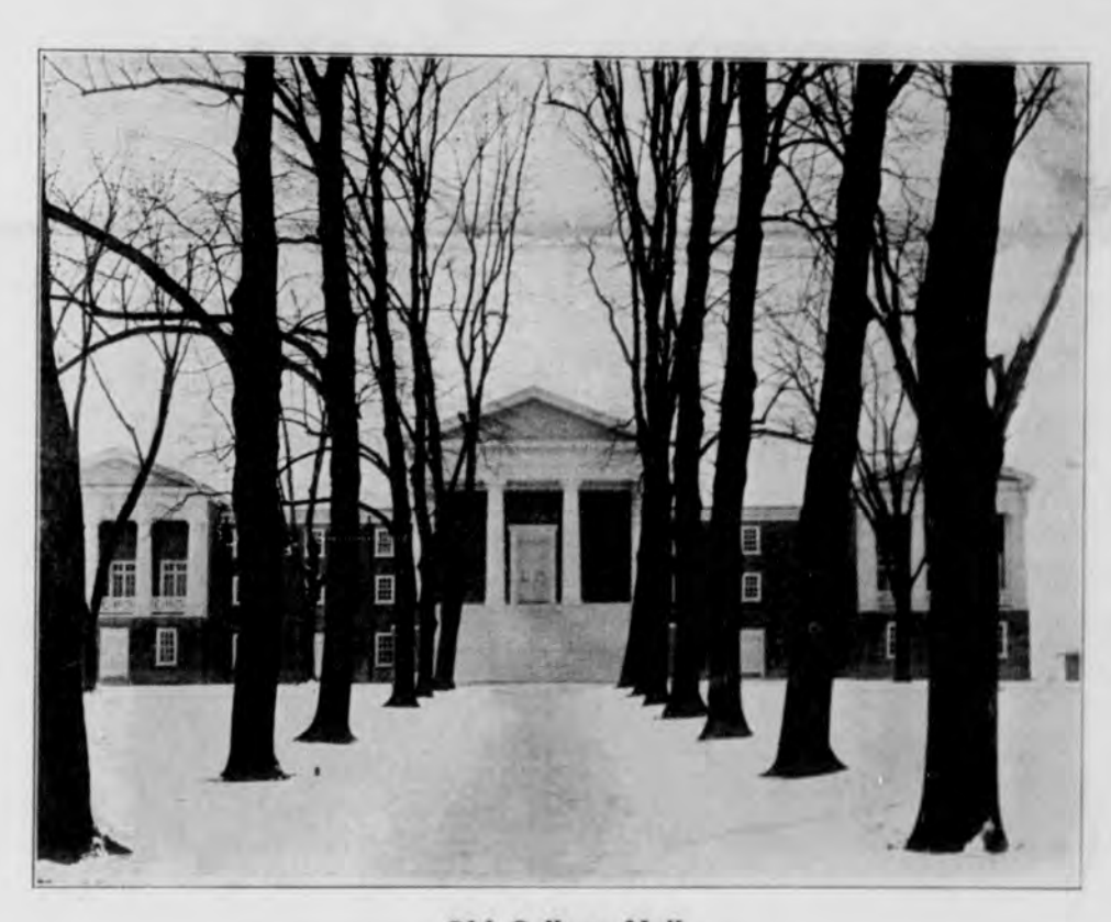
Old College Hall