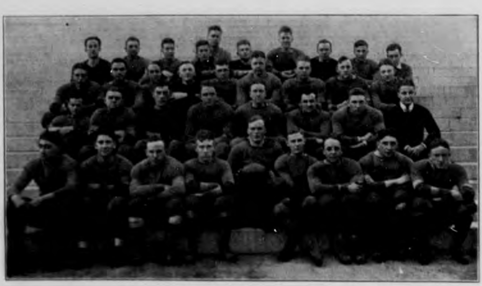
1917 Football Squad