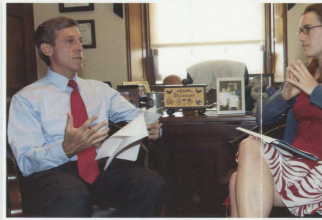
Rep. Carney speaks with a staff member about pending legislation

Rep. Carney's balanced budget amendment is structured similarly to Delaware's requirement. It separates the operating budget from the capital budget, enabling large investments in infrastructure and other assets that are financed over the long-term. His amendment protects Social Security and allows for emergency spending in times of economic recession or war.