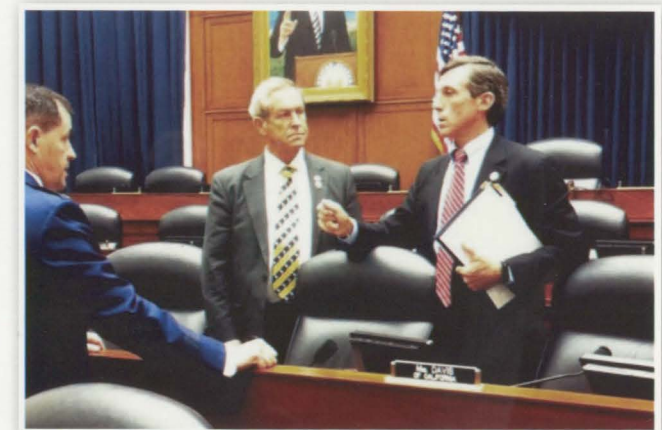
Rep. Carney speaks with colleagues in a committee hearing

"Carney knows that to get anything done, he needs Republican friends, so he works to forge relationships through his seat on the House Financial Services Committee, discussions at lunch and the gym, and his caucus memberships."