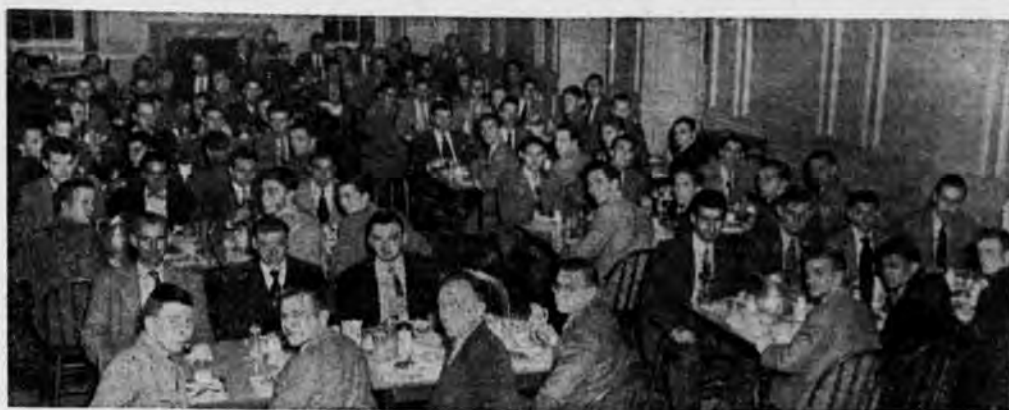
A big banquet? An annual dinner? Nope, just a regular monthly dinner meeting of the Student ASME. The attendance broke all records for monthly meetings of any University group. In fact, to the embarrassment of the officers, the committee was obliged to turn a number of the members away from the delicious dinner.

The entire campus is invited to act as "judges" for the Cheerleader's Cup awarded to the best decorated house on Friday. Be sure to see Theta Chi's—and if you're an upperclassman—drop in and see our new television set and