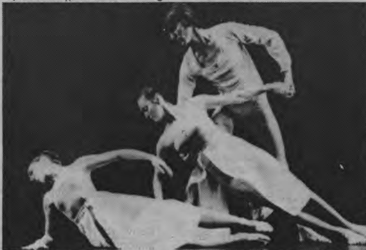
MOTION AND BALANCE ...The Utah Repertory Dance Theatre will be appearing at the university from Oct. 26 to Oct. 28.

Oct. 28 as part of the Performing Arts Series at the university.