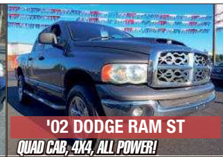
'02 DODGE RAM ST QUAD CAB, 4X4, ALL POWER!