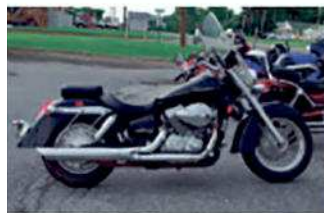
2006 Honda VT750C $2,995