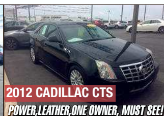
2012 CADILLAC CTS POWER, LEATHER, ONE OWNER, MUST SEE!