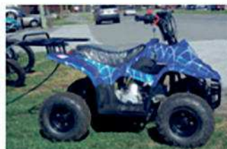
New 2017 TaoTao Bolder 110 $699.99