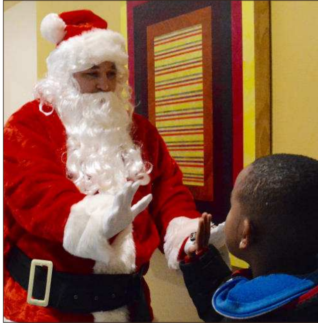
Santa offers high-fives as he makes his way into the community building at Alder Creek.