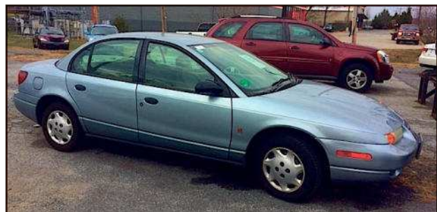
2002 Saturn SLI Sedan Automatic, Low Miles, Won't Last!! $Call for Pricing$