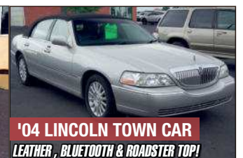
'04 LINCOLN TOWN CAR LEATHER, BLUETOOTH & ROADSTER TOP!