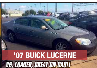
'07 BUICK LUCERNE V6, LOADED, GREAT ON GAS!!