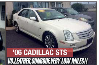
'06 CADILLAC STS V6, LEATHER, SUNROOF, VERY LOW MILES!!

FRIENDLY AND KNOWLEDGEABLE SALES STAFF IS HERE TO HELP YOU!