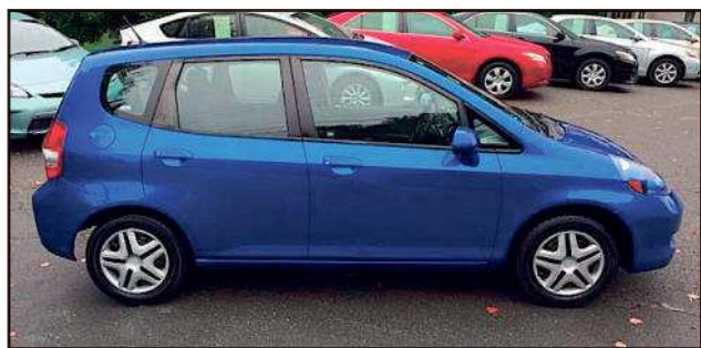
2008 Honda Fit 4 Door Hatchback, Automatic, Nice!! $Call for Pricing$