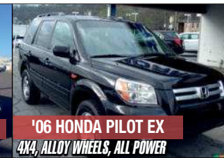
'06 HONDA PILOT EX 4X4, ALLOY WHEELS, ALL POWER