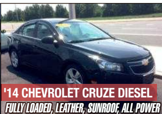
'14 CHEVROLET CRUZE DIESEL FULLY LOADED, LEATHER, SUNROOF, ALL POWER