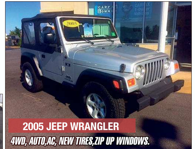
2005 JEEP WRANGLER 4WD, AUTO, AC, NEW TIRES, ZIP UP WINDOWS.