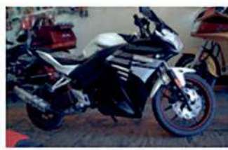
New 2017 Racer 50 $1,795