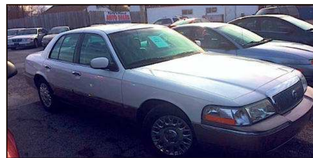
2003 Mercury Grand Marquis Leather, All Power, Low Miles!! $Call for Pricing$