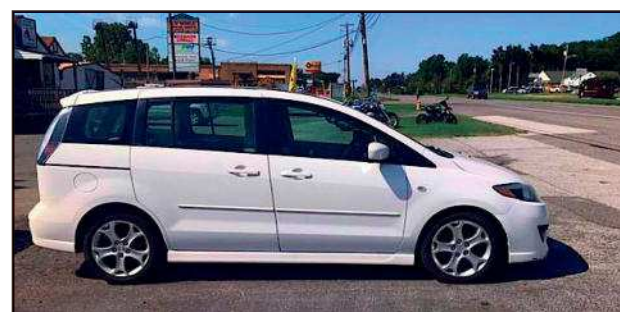
2008 Mazda 5 Grand Touring 2.3 I4, Automatic, 4 Door Mini Van Great on Gas! Must See!!