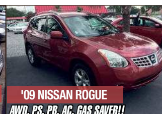
'09 NISSAN ROGUE AWD, PS, PB, AC, GAS SAVER!!

Ask About Our Credit Approval Guaranteed