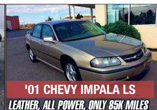
'01 CHEVY IMPALA LS LEATHER, ALL POWER, ONLY 85K MILES