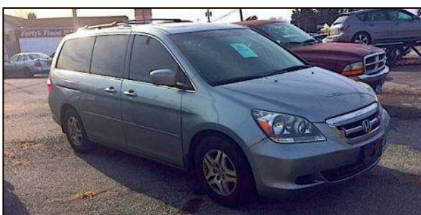
2007 Honda Odyssey EXT Leather, 7 Passenger, Must See!! $Call for Pricing$