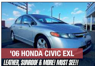
'06 HONDA CIVIC EXL LEATHER, SUNROOF & MORE! MUST SEE!!