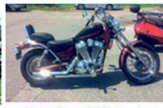
1997 Suzuki Intruder VS1400, Like New! $2,195