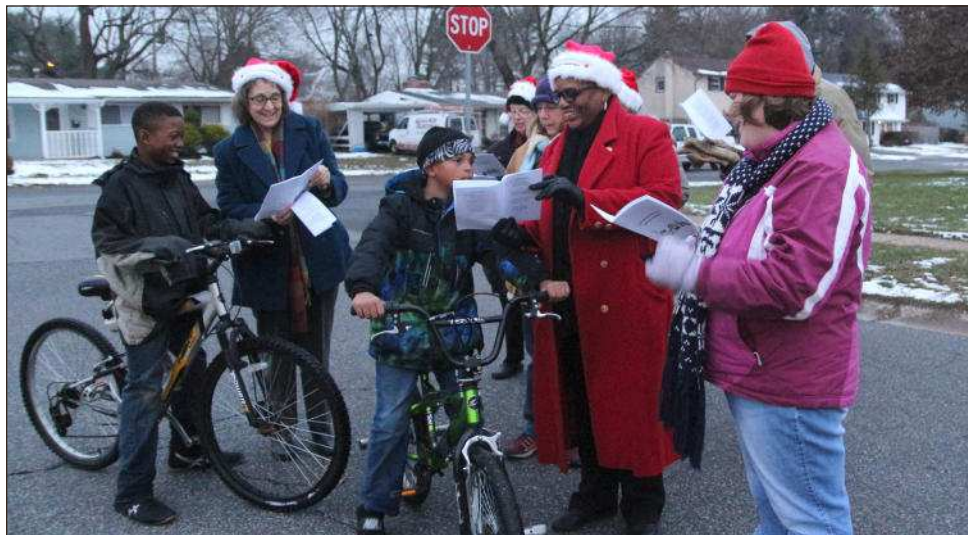
Carolers from St. Nicholas Church serenade two kids who were riding their bikes down Martell Drive in Brookside on Sunday evening.