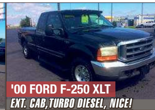
'00 FORD F-250 XLT EXT. CAB, TURBO DIESEL, NICE!