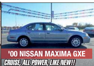
'00 NISSAN MAXIMA GXE CRUISE, ALL POWER, LIKE NEW!!