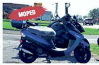
New 2017 Speedy 50 $895