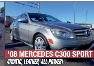
'08 MERCEDES C300 SPORT 4MATIC, LEATHER, ALL POWER!