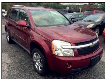
2007 Chevy Equinox AWD, All Power!! Must See! Winter is around the corner!! $Call for Pricing$