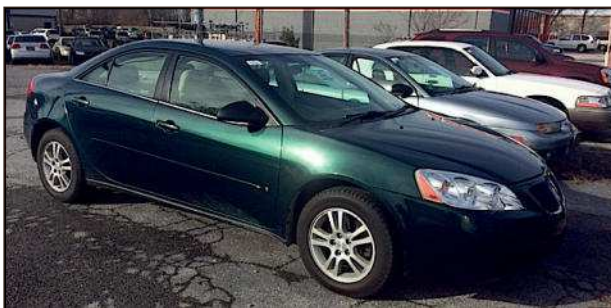
2006 Pontiac G6 PS, PB, A/C, Nice!! $Call for Pricing$