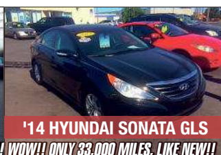
'14 HYUNDAI SONATA GLS WOW!! ONLY 33,000 MILES, LIKE NEW!!