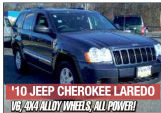
'10 JEEP CHEROKEE LAREDO V6, 4X4, ALLOY WHEELS, ALL POWER!