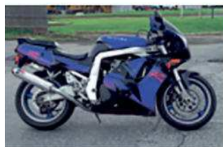
Suzuki GSX-R 600 $2,495