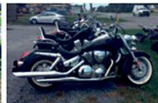
2003 Honda VTX 1300 $2,995

710 Pulaski Hwy., Bear, DE. 19701 See more at fortysfinest.com