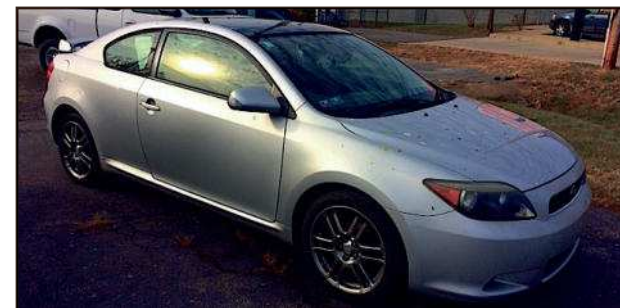
2005 Scion Auto, PS, PB & More Must See!!