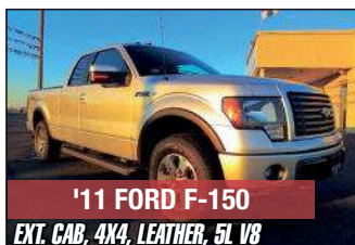
'11 FORD F-150 EXT. CAB, 4X4, LEATHER, 5L V8

FRIENDLY AND KNOWLEDGEABLE SALES STAFF IS HERE TO HELP YOU!