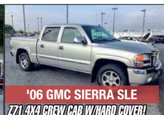
'06 GMC SIERRA SLE Z71 4X4 CREW CAB W/HARD COVER!