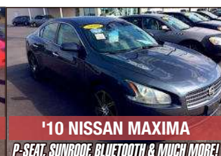
'10 NISSAN MAXIMA P-SEAT, SUNROOF, BLUETOOTH & MUCH MORE!