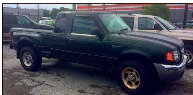
2001 Ford Ranger EXT Extended Cab, Automatic, AC, Nice! $Call for Pricing$