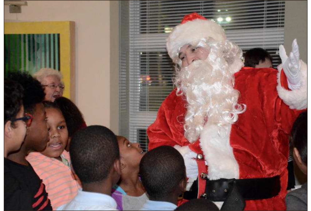
Santa talks to kids at the Alder Creek community building during a Toys for Tots event Wednesday.

As the kids took their turns on Santa's lap, electronics and toys of all types were among the more popu-