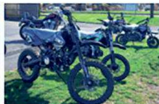
New 2017 TaoTao Dirt Bikes Starting at $749.99