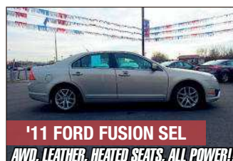
'11 FORD FUSION SEL AWD, LEATHER, HEATED SEATS, ALL POWER!!