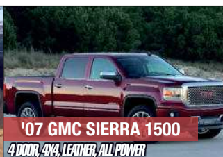
'07 GMC SIERRA 1500 4 DOOR, 4X4, LEATHER, ALL POWER