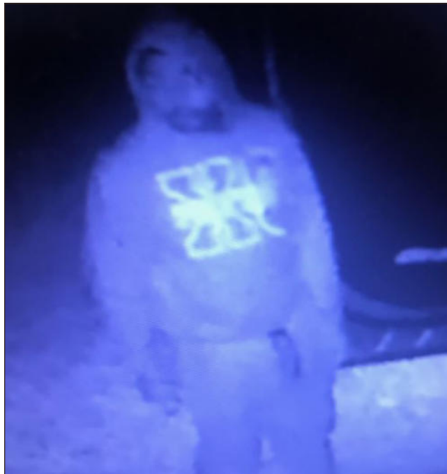
Police believe this person stole items from a car in Cobblefield.

A surveillance camera in the area captured images of the two suspects. One was wearing a large hooded sweatshirt and boots. The second was wearing a hooded sweatshirt with the letters "XC" on the chest.