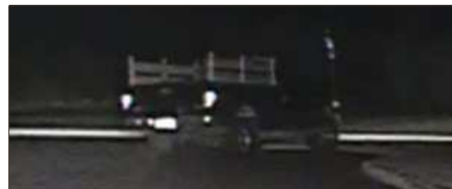
A man who stole from Home Depot drove away in this truck.

The thief – described as a black man wearing a green jacket and black knit hat – stole the vacuum and eight bottles of laundry detergent