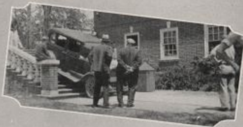
THE CLOWNS AT WORK