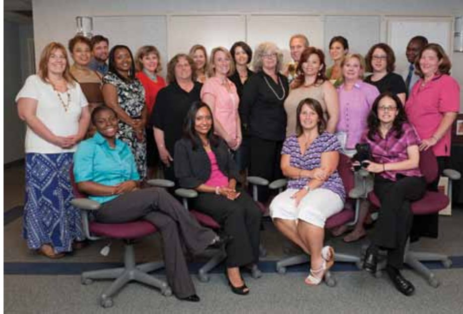
The May 2010 graduating class of the Nonprofit Management Certificate course

The 16-week Nonprofit Management Certificate Course provides managers with a firm understanding of the concepts and principles of professional management and the knowledge of problem-solving tools and techniques needed for success in the nonprofit field. The NPMCC covers a wide-range of interrelated subject matters and uses an integrated approach that enables nonprofit managers to learn and experiment with the practical applications of management. The topics include organizational assessment and planning, volunteer management, and technology. Instructors for the course include regional professionals and UD faculty who are experts in their respective fields.