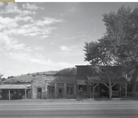
The Kramer-McGovern-Strasburger, Commercial Block in Virginia City, Montana, was one of the historic resources documented by CHAD staff and students for the Montana Historical Commission in August 2009.

The graduate certificate in Historic Preservation is made up of the four core courses of the MAHP. Intended for those who might be considering a career in historic preservation, for students in related programs wishing to expand their portfolio of skills, and for professionals seeking to update their knowledge of the current state of the field, the certificate program can be completed in three semesters, separately or in conjunction with another degree. Credits earned in the