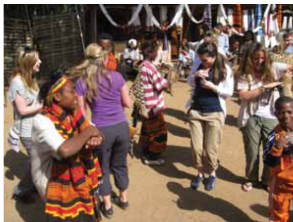
Students enjoy the cultural traditions of an Omo Valley tribe.