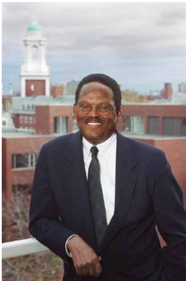
Professor William Julius Wilson of Harvard University