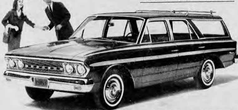
1963 Rambler Classic Six "770" Cross Country Station Wagon.