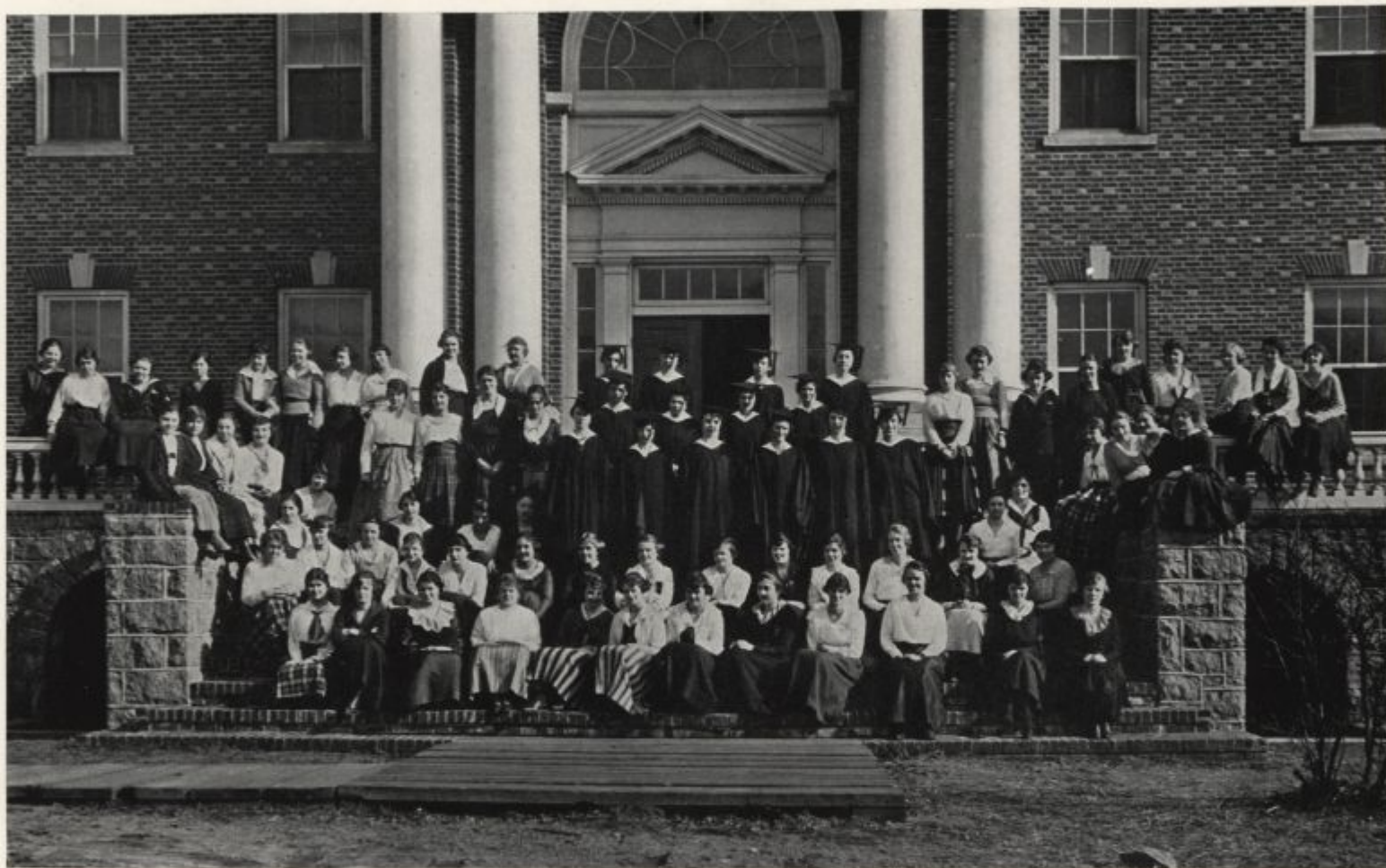
All College Picture