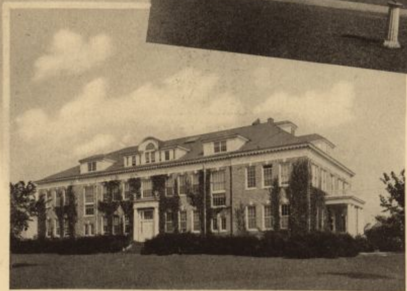
Women's College Scenes