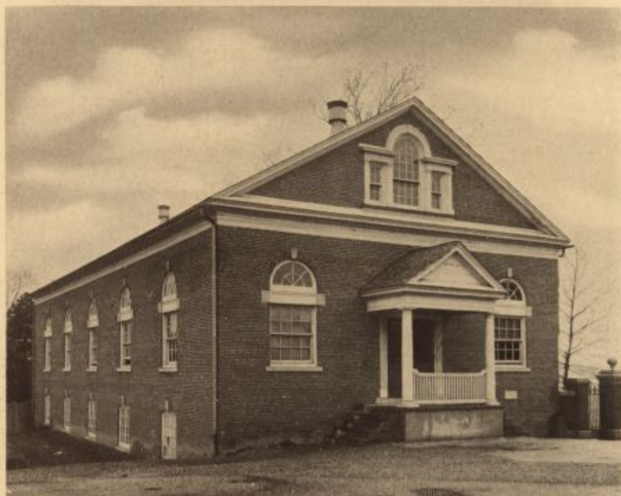
Mechanical Hall [1904]