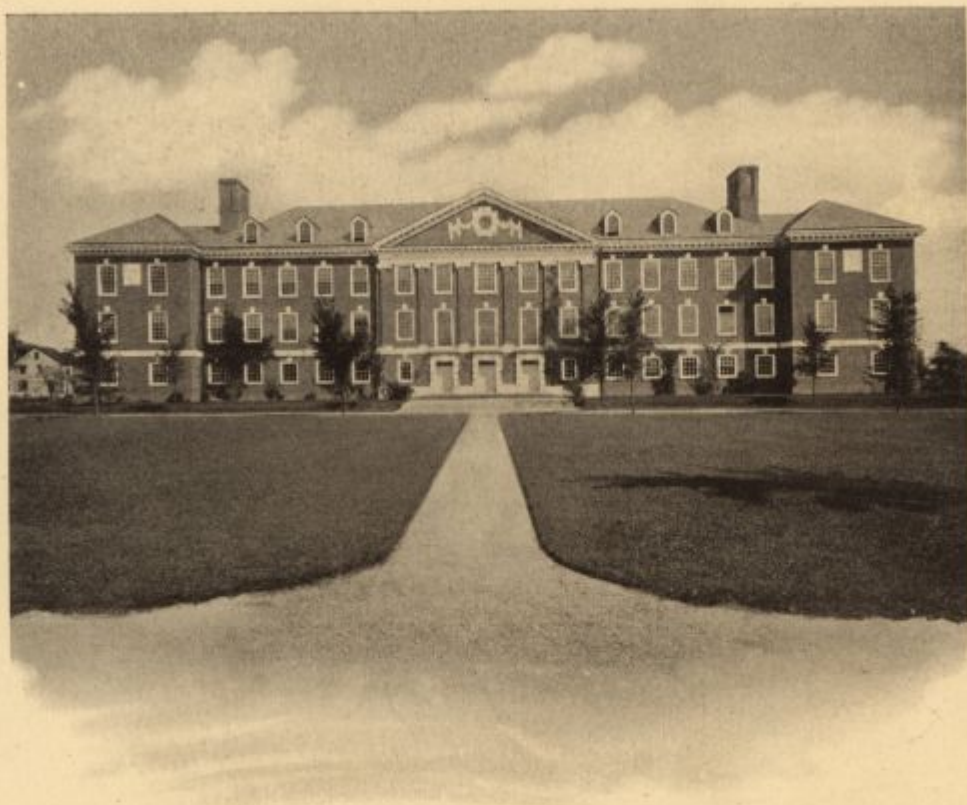
Wolf Hall (1917)

Majestic and apart; Too much aloof to be well known, Too young to have a soul