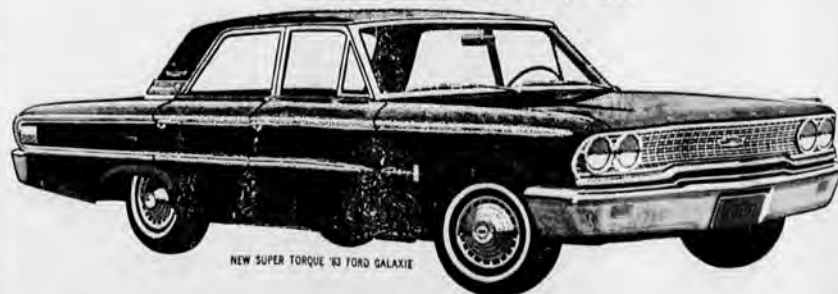
NEW SUPER TORQUE '63 FORD GALAXIE

●● Ford Galaxie offers Thunderbird V-8's with up to 405 hp! ●●