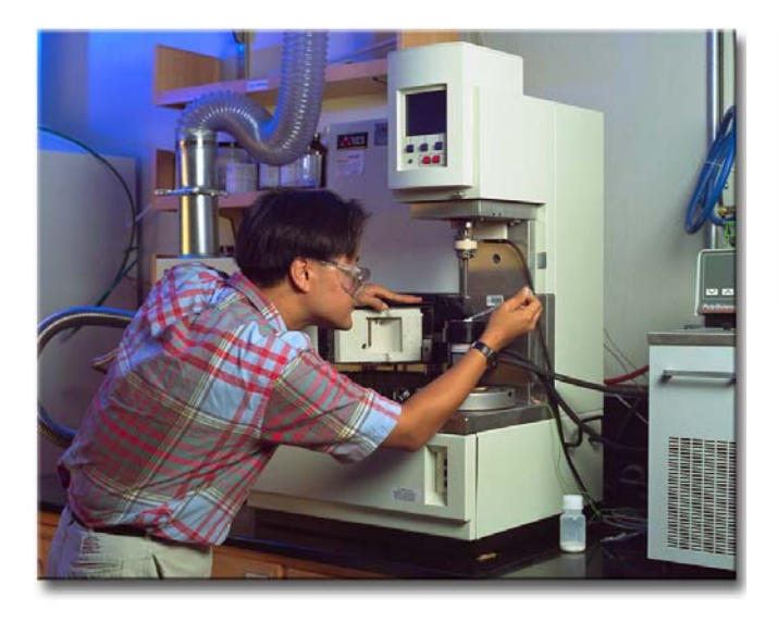
DoD Centers of Excellence 6.1 / 6.2 Research

Students and faculty in the Center are affiliated with the University of Delaware departments of Chemical, Civil & Environmental, Electrical & Computer, Materials Science &