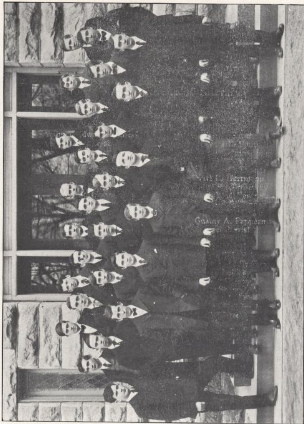
THE DELAWARE COLLEGE ENGINEERING SOCIETY