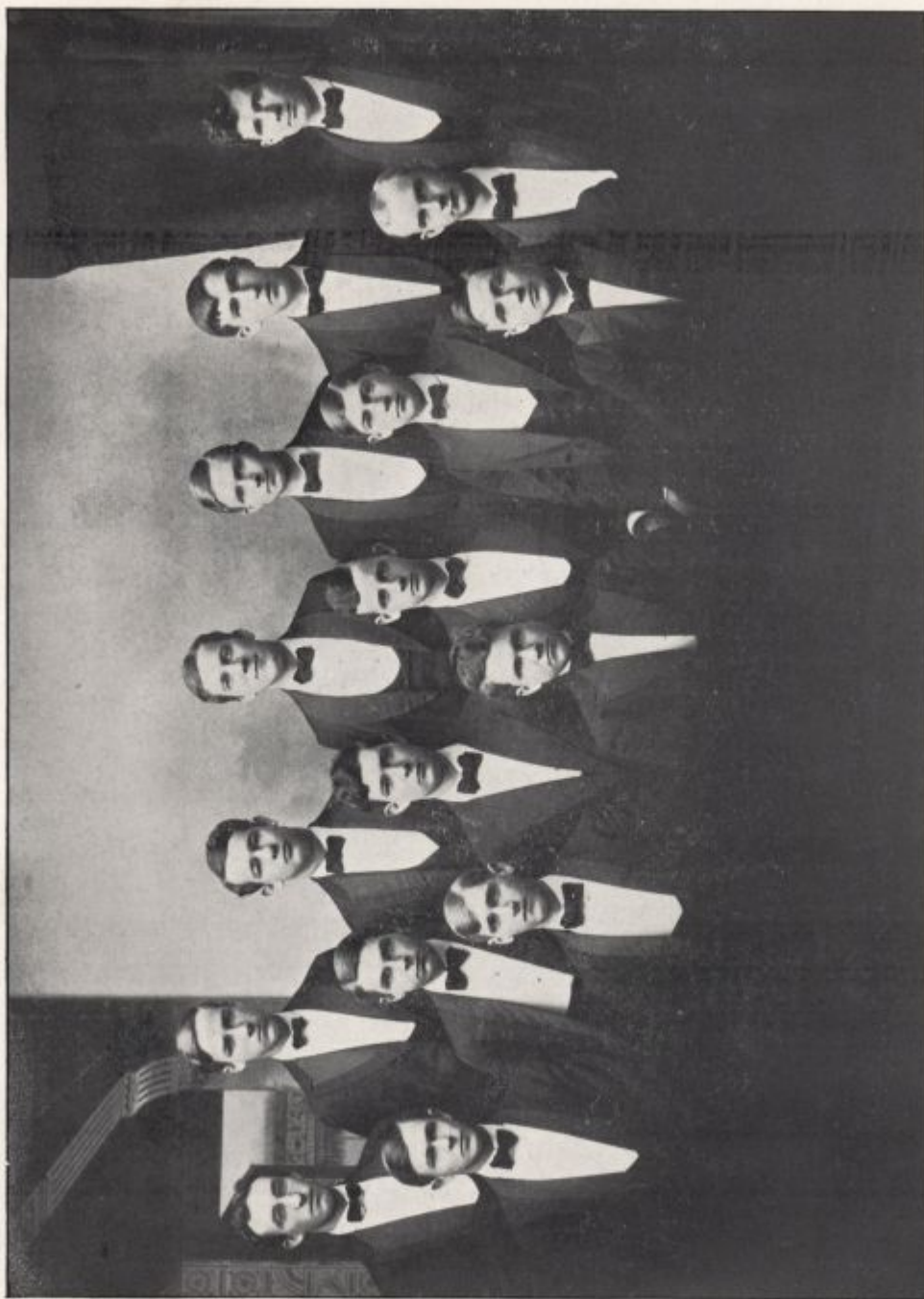
THE KAPPA ALPHA FRATERNITY