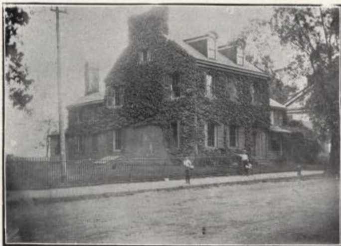
KAPPA ALPHA HOUSE