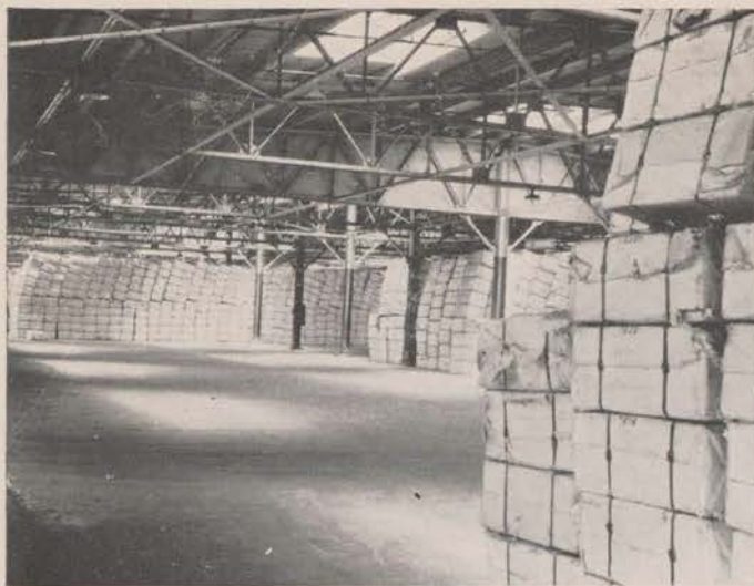
Wood Pulp Stored in a Section of the Wilmington Marine Terminal Warehouse