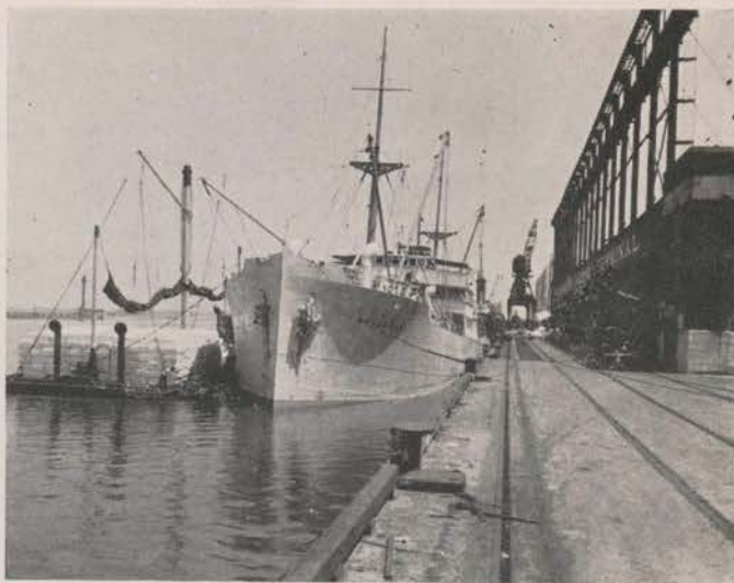
Discharging Wood Pulp from Baltic Ports to Warehouse and Lighter