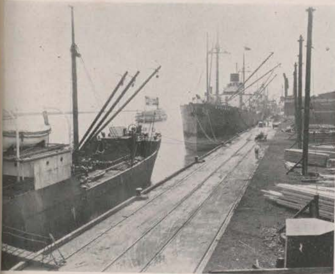
Steamers Discharging Cargo at the Wilmington Marine Terminal Pier

The trend of business of the terminal has been definitely upward since the first year of its operation. In that year to June 30, 1924, a total of 17,063 tons of cargo were handled. The growth since that time