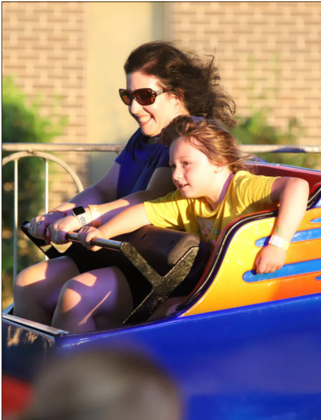
Rides proved popular at the 16th-annual Summerfest carnival.

Thousands of people flocked to Holy Family Church for the 16th-annual Summerfest carnival over the weekend. Held on the church's Gender Road property from July 10-14, the carnival started as a way to celebrate the church's 25th anniversary and eventually grew into an annual event that serves as one of the church's main fundraisers. During the five-day event, church volunteers served up food and organized entertainment, while the nationally touring carnival company Wade Shows provided a midway complete with rides, games and concessions.