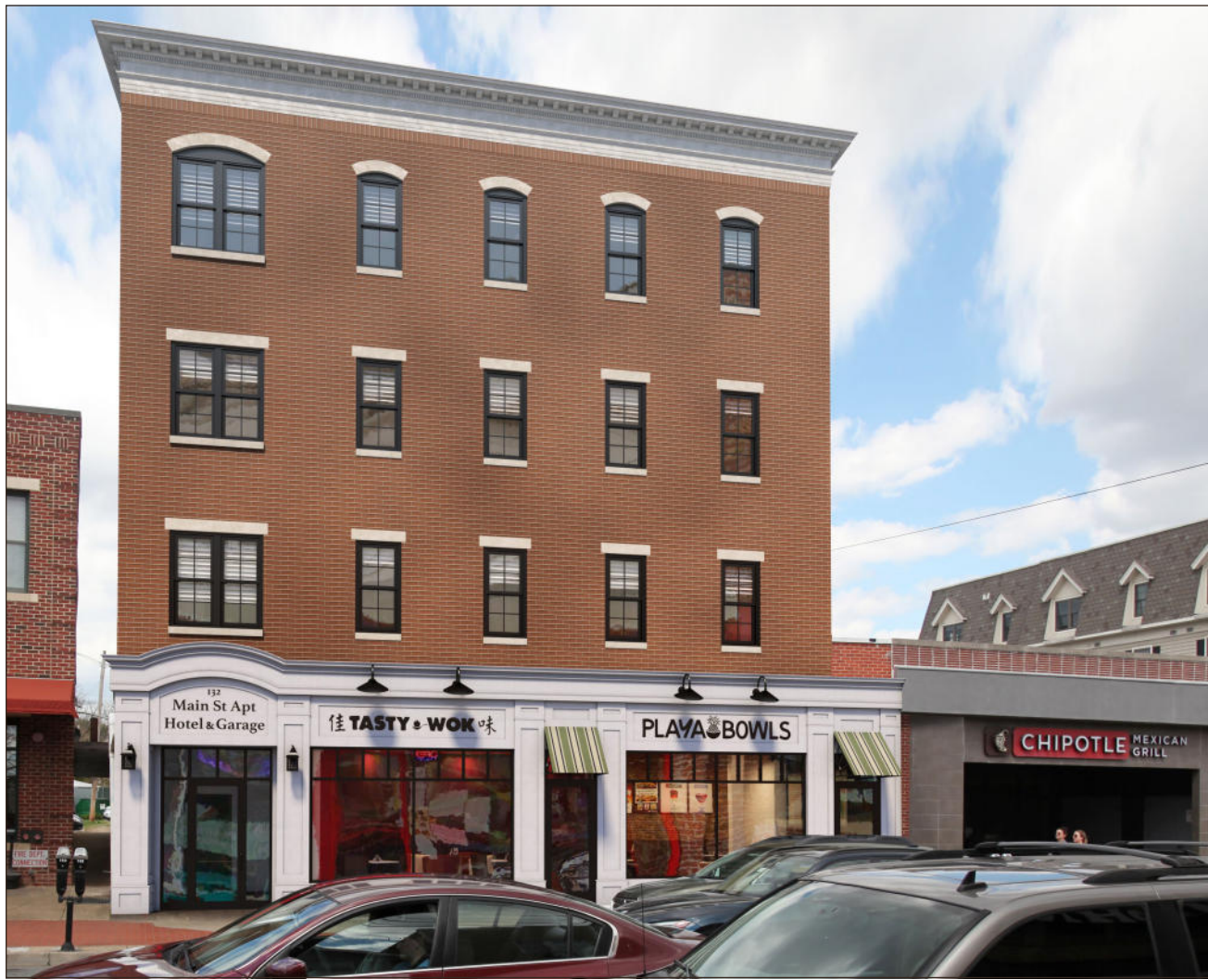
An artist's rendering shows the front of the retail and apartment portion of a mixed-use project proposed for 132 E. Main St. Not visible from this perspective is the 10-story hotel/garage that would be built behind it.

Most of the garage/hotel portion would be built on land that Danneman owns and currently leases to the city for use as a parking lot, but it would also extend onto