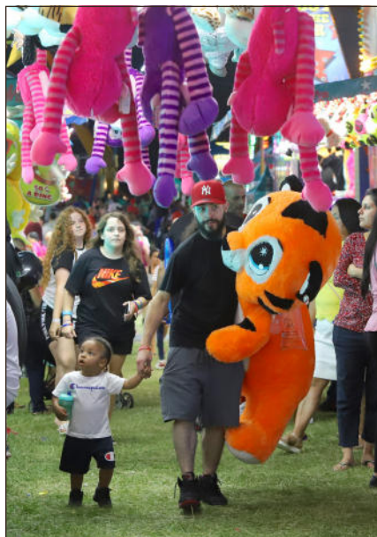
The 16th-annual Summerfest carnival drew thousands of people to the grounds of Holy Family Church on Saturday.