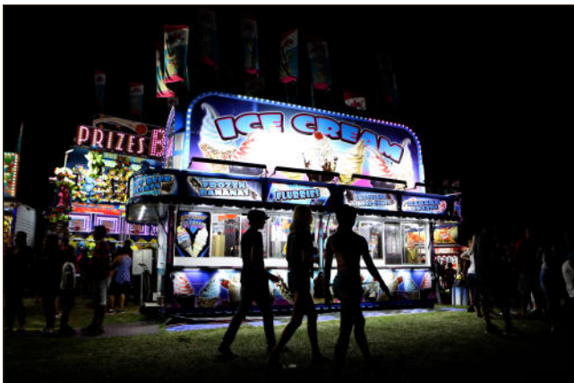
The lights of the midway illuminate the grounds of Holy Family Church.