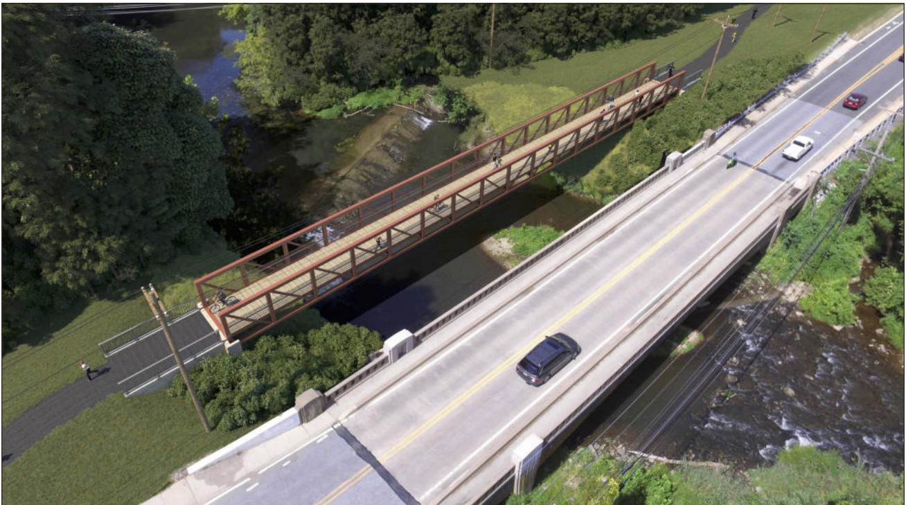
Submitted image. An updated artist's rendering shows the pedestrian and bicycle bridge that will be built over White Clay Creek near the Paper Mill Road vehicular bridge.

The project has been discussed since 2011, and in 2015, city officials announced they had secured $1 million in federal and state grants. At the time, officials said those grants would cover the complete cost of the project, but the estimate was later raised to $1.75 million, mostly because of the additional engineering and environmental permits needed to build a bridge over the creek, which is designated as a National Wild and Scenic River.